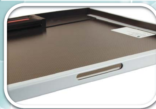
Custom Utility Ports